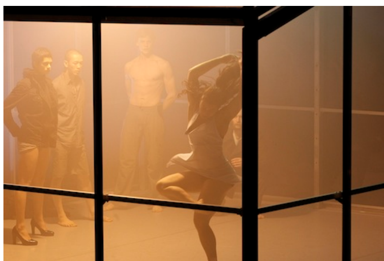
An Act of Now, Chunky Move.