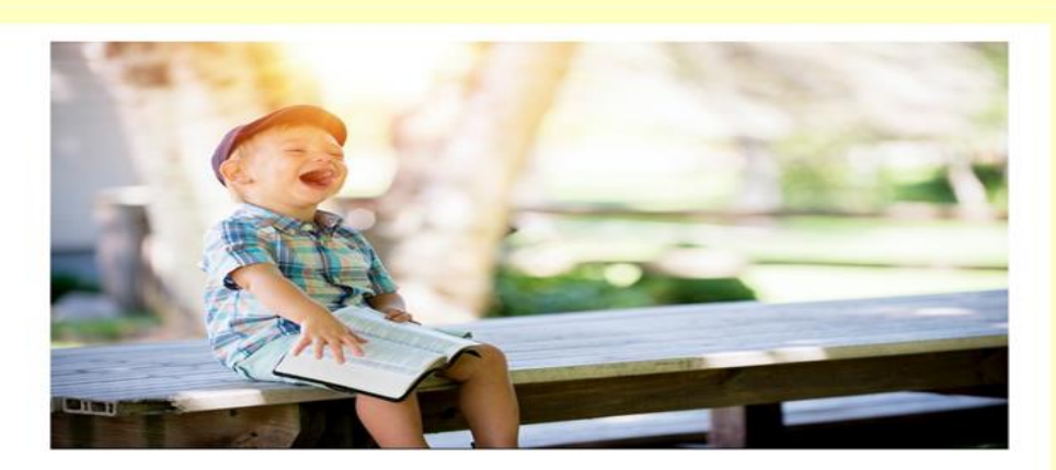
A Hopeful dimension of working in the field of Teacher Education is ...

an increasing awareness of the affordances of the cross-disciplinary nature of teacher education faculties and the ways in which technology enables new possibilities for approaches to wellbeing, citizenship, inclusion and equity.