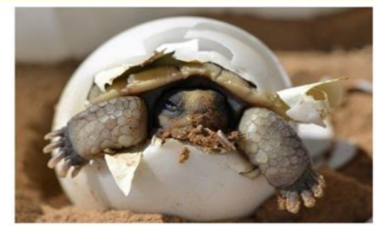
A Hopeful dimension of working in the field of Teacher Education

Albeit slow, a hopeful dimension is the change that is occurring. There seems to be those who want to make changes to policies and practices. Although it is hard to convert some colleagues (and leadership) into new ways of thinking, there are those that are persistent.