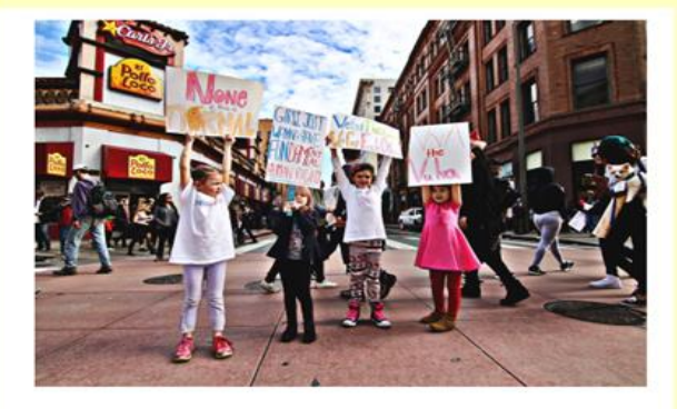
A Hopeful dimension of working in the field of Teacher Education is ...

Preparing future teachers to become invested in the SDGs and to be confident in using the Education platform as a platform for change and to invest in living sustainably as part of everyday teaching and learning