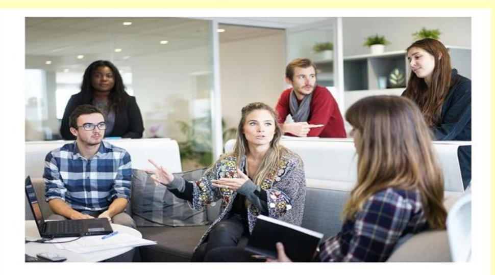
A Hopeful dimension of working in the field of Teacher Education is ...

the number of teachers involved in research about their own practice. Academics working with teacher researchers can strengthen the connections between academia and the field, and generate new knowledge about learning and teaching that is grounded in practice and useful to classroom teachers.