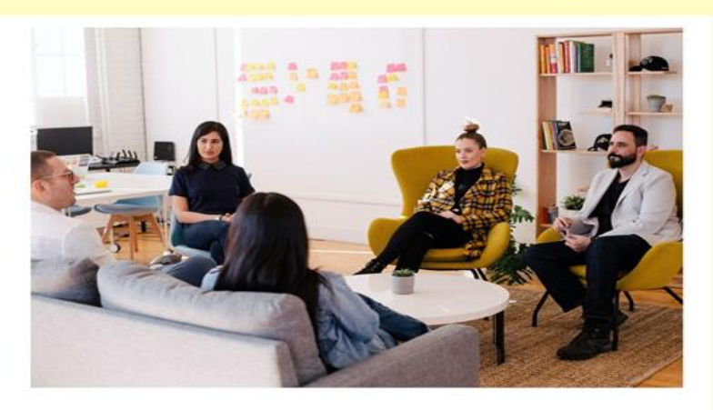
A Hopeful dimension of working in the field of Teacher Education is

One of the things that sustains me in teacher education work is the hope that I feel in relation to working with pre-service teachers and with my colleagues. We continue to find interesting and creative ways to do things and it gives me hope that we might change the system from the inside.