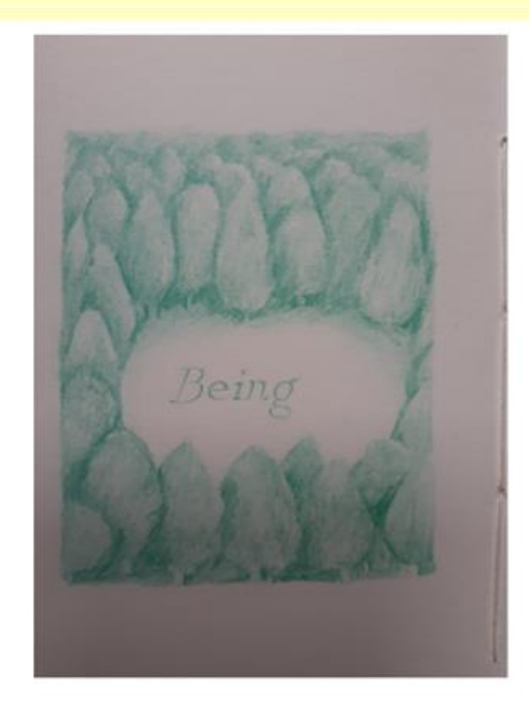
A Hopeful dimension of working in the field of Teacher Education is ...

Knowing that our PSTs are entering a profession that is more adverse to looking after graduates and supporting them with mentoring and wellbeing needs