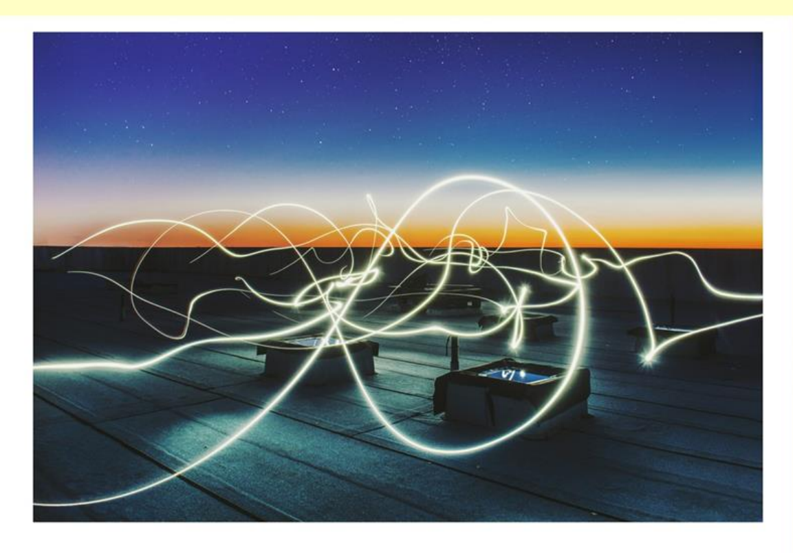
A Hopeful dimension of working in the field of Teacher Education is ...

the collaborative superpowers of all teachers, whose dedication, inventiveness, adaptability and generosity came to the fore in the 2020 shift to remote teaching. The speed and visibility of digital sharing for strengthening teaching and learning has given a new appreciation for teachers and, hopefully, elevated the prestige of the profession.