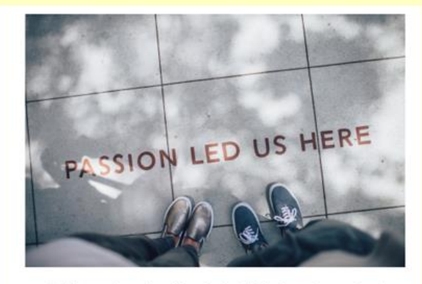
A Hopeful dimension of working in the field of Teacher Education is ...

the collaborative superpowers of all teachers, whose dedication, inventiveness, adaptability and generosity came to the fore in the 2020 shift to remote teaching. The speed and visibility of digital sharing for strengthening teaching and learning has given a new appreciation for teachers and, hopefully, elevated the prestige of the profession.