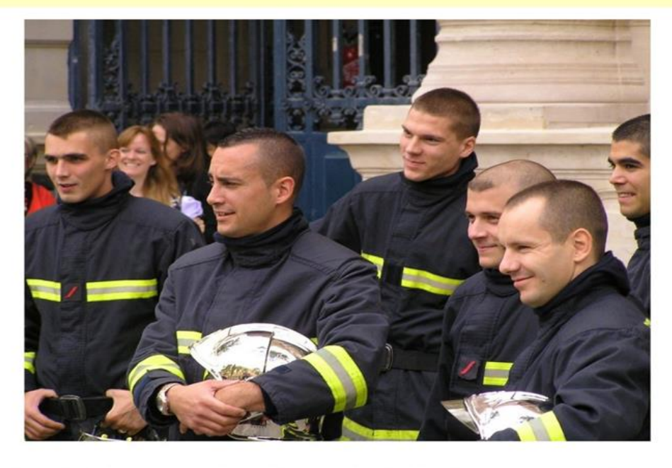
A Hopeful dimension of working in the field of Teacher Education is ...

Collaborating with colleagues, students, teachers and more to enhance the quality of the teaching profession across the board