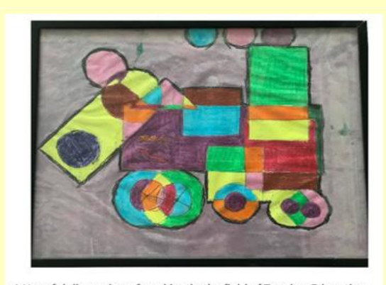
A Hopeful dimension of working in the field of Teacher Education is ...

the enthusiasm, compassion, courage and energy of many early career teachers - they have the potential to speak up and not accept the controls that are constantly being placed on the profession, They will need to be strong and tenacious and not accept the blame so often heaped on our profession. I have used an image of a lion to try to encapsulate.