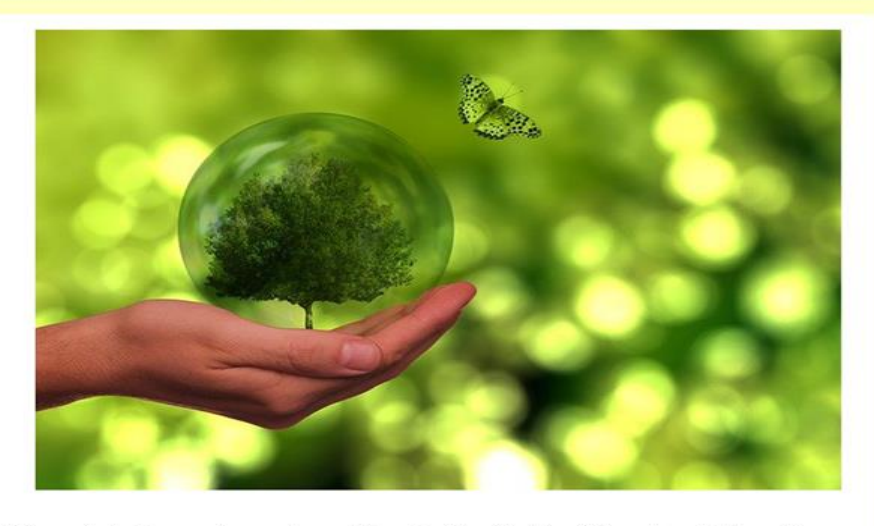
A Hopeful dimension of working in the field of Teacher Education

the resilience and perserverance of teacher educators in the face of many big challenges.