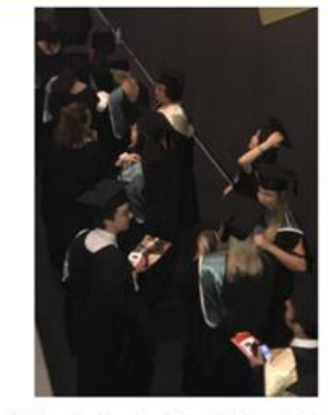
A Hopeful dimension of working in the field of Teacher Education is

A hopeful dimension of working in the field of Teacher Education is seeing the spark, passion, commitment of many preservice teachers who are prepared to shift the education agenda and engage with the big questions and debates of our time. It's heartening to feel that the baton can be passed on!