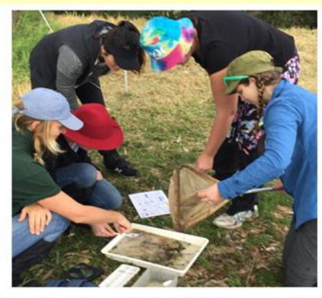
A Hopeful dimension of working in the field of Teacher Education is

Preparing future teachers to become invested in the SDGs and to be confident in using the Education platform as a platform for change and to invest in living sustainably as part of everyday teaching and learning