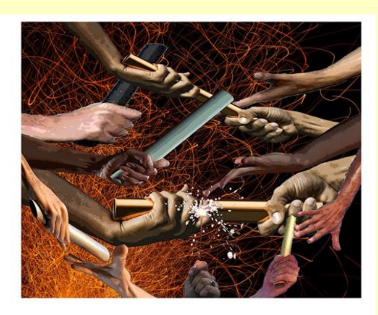
A Hopeful dimension of working in the field of Teacher Education is ...

A hopeful dimension of working in the field of Teacher Education is the consistent graduate success stories. Despite the challenges administratively and in delivering crowded curriculums the high level of expertise demonstrated by graduates is quietly fulfilling. Classroom readiness is outdone by passionate and gratifying stories from the field.