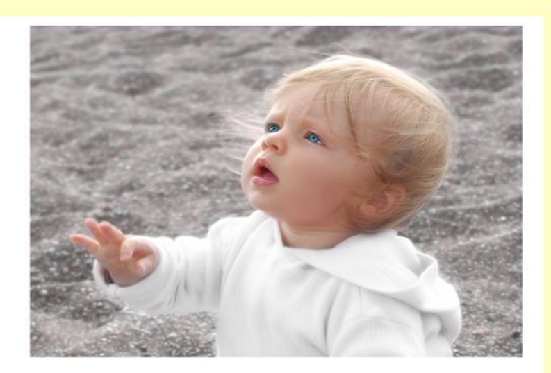
A Hopeful dimension of working in the field of Teacher Education is ...

Clearly happy, French firemen gather to celebrate a colleague's marriage. There's something to look forward to; optimism about what lies ahead. So too with teacher education in Australia: after years of working in isolation, the three TPA consortia that formed after TEMAG are now finding their collective voice. They are starting to talk back.