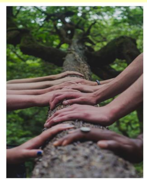
A Hopeful dimension of working in the field of Teacher Education is ...

I haven't met a staff member yet who isn't completely committed to what they do and what they believe it. It is a wonderful environment to work in and for students to study in.