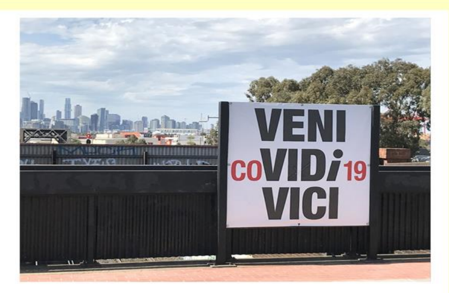
A Hopeful dimension of working in the field of Teacher Education

Each year, the emergence of inspiring novice teachers from their teacher education provides hope for the ongoing progression of education from the