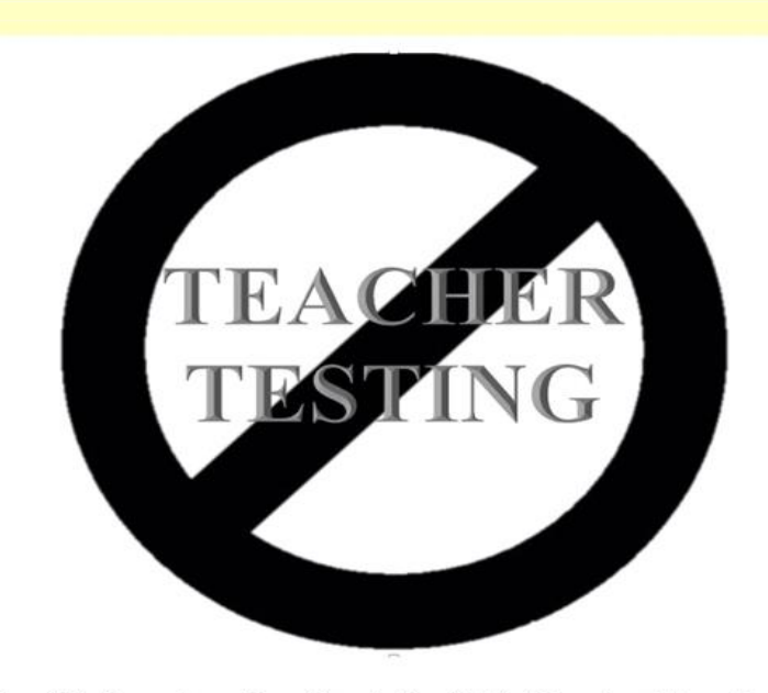
A Hopeful dimension of working in the field of Teacher Education is ...

that many things change but many of the good things remain the same. Children are essentially the same, and pre-service teachers still have the same hopes and aspirations as we did forty or more years ago.