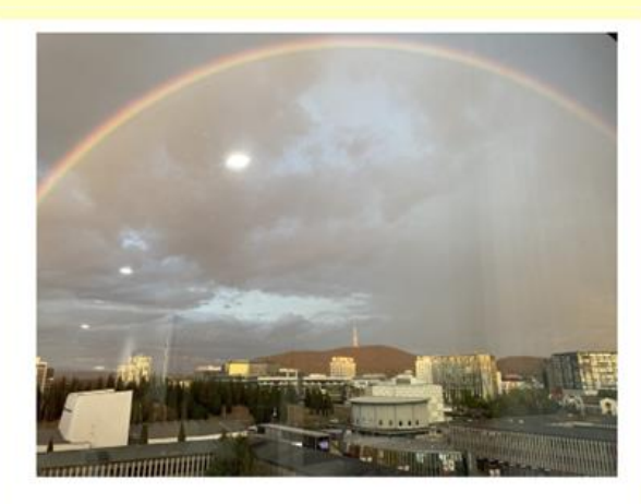
A Hopeful dimension of working in the field of Teacher Education is

working with pre-service teachers who are really passionate and want to be the best teachers they can be.