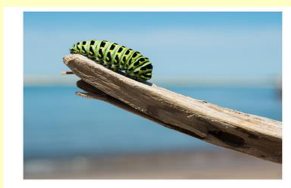
A Hopeful dimension of working in the field of Teacher Education

Albeit slow, a hopeful dimension is the change that is occurring. There seems to be those who want to make changes to policies and practices. Although it is hard to convert some colleagues (and leadership) into new ways of thinking, there are those that are persistent.