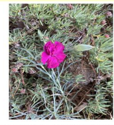
A Hopeful dimension of working in the field of Teacher Education

the opportunity to observe the level of commitment of pre-service teachers have to making a difference to the lives of young people through teaching. Teaching at any level provides opportunities to learn and improve practice, it is in its very nature a hopeful enterprise that is only enhanced through working with others.