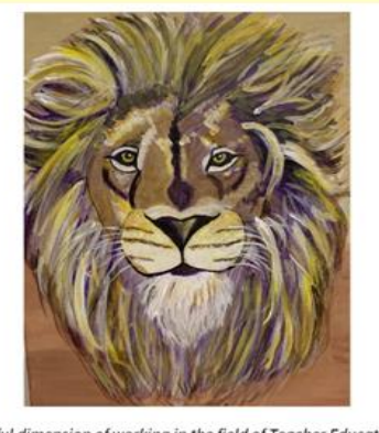
A Hopeful dimension of working in the field of Teacher Education is \dots

thinking that future teachers will make a difference with students and future citizens and believing that somehow our work will have an impact in the coming times.